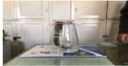
( Fig., 3)

(Fig.,1) Pieces of magnetic (Fig. 2) apparatus of Mille Tesla meter (Fig. 3) the rearing cages